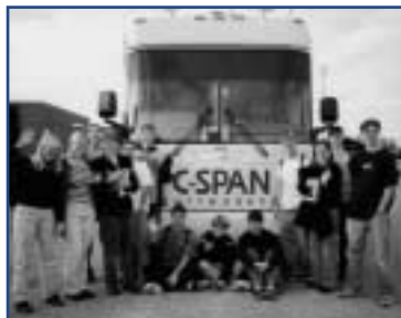
For more information on C-SPAN School Bus schedules go to c-span.org/classroom

If you would like to request a Bus visit, contact your local cable system. For more information, call C-SPAN's Community Relations department at 202-737-3220.